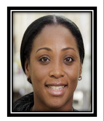
capacity - Deputy Chairman or Secretary.

With my organisational skills I am happy to serve the PTA in the following